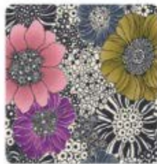
Anemones by Missoni