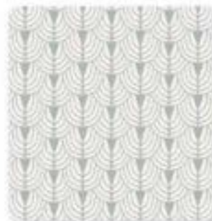
Camille by Coordonne