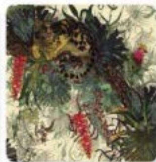
Tropical Clouded Leopard by Timorous Beastie